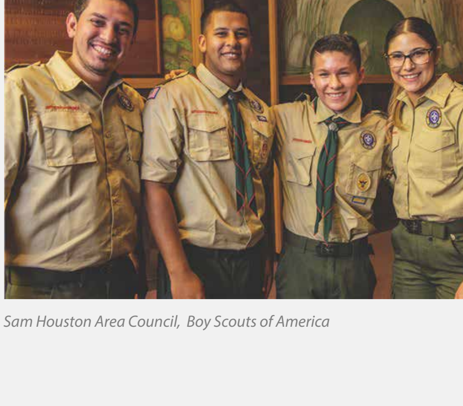
Sam Houston Area Council, Boy Scouts of America