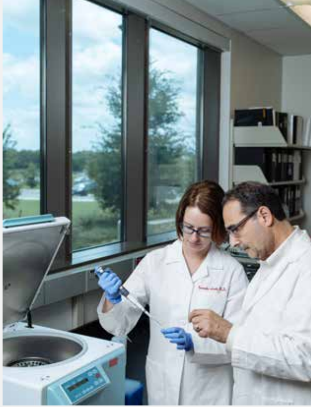
Texas Biomedical Research Institute

*Note that some clients are not listed because of desire for confidentiality.