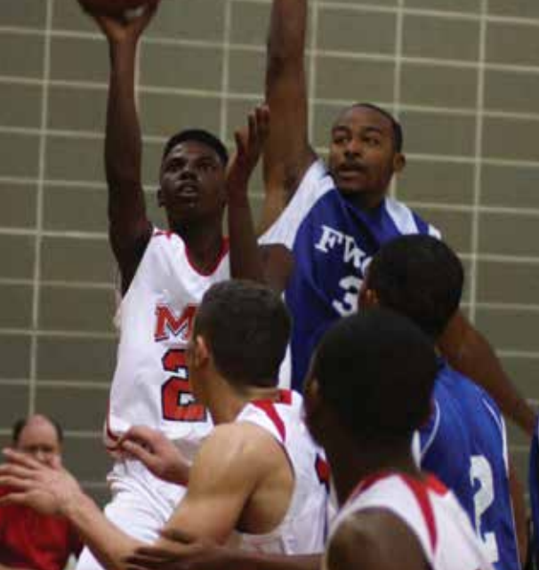
Methodist Children's Home