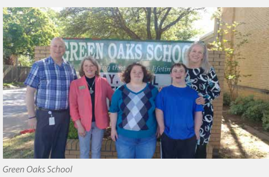
Green Oaks School